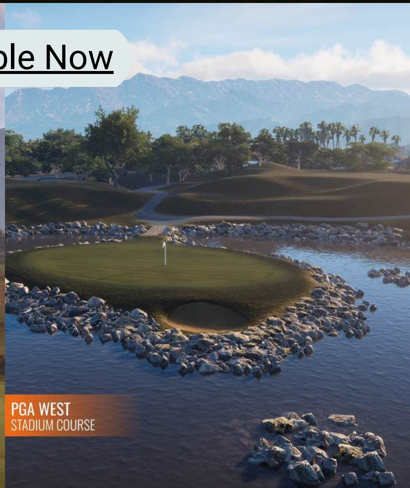
PGA WEST STADIUM COURSE