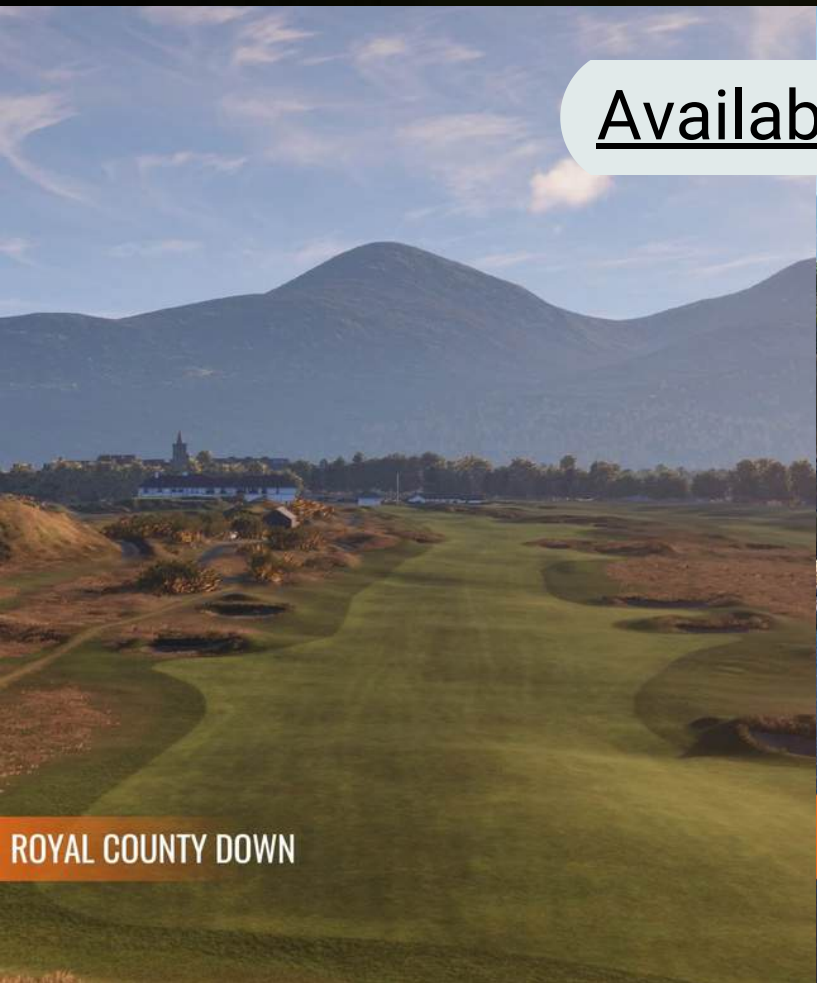
ROYAL COUNTY DOWN